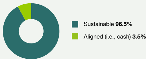
The proportion of the portfolio invested as a sustainable investment (%)

The following metrics are used to monitor whether the companies the Fund is invested in continue to meet the manager’s sustainability approach.