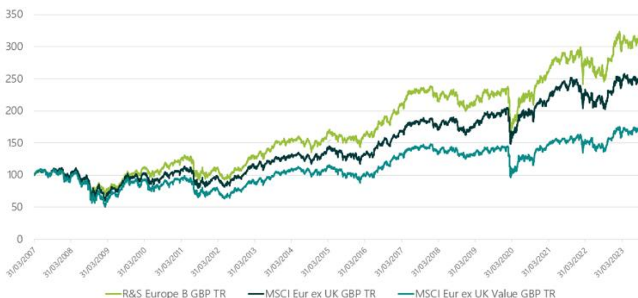
Figure 3: R&S European Fund has outperformed despite stylistic headwinds

The value of any investment, and the income generated from it may fall as well as rise and will be affected by currently fluctuating changes in interest rates, general market conditions and other political, social and economic developments, as well as by specific matters relating to the assets in which it invests.